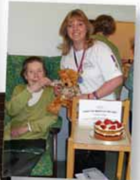
Help for Heroes fund raising

Regular social activities such as our Chairobic's sessions continue to be popular. We have recently set up an art and craft group and are planning a trial Bingo afternoon with a view to making it a regular activity.