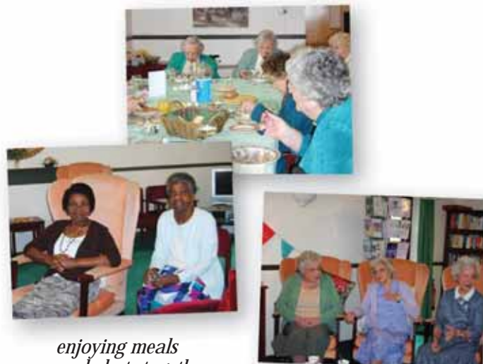
enjoying meals and chats together