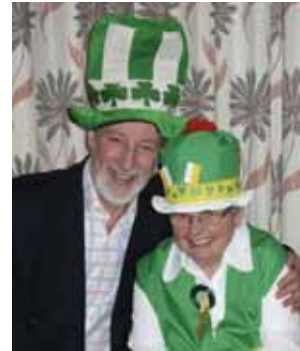
Going Green for St Patrick!